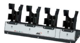
4-Position Terminal Charger